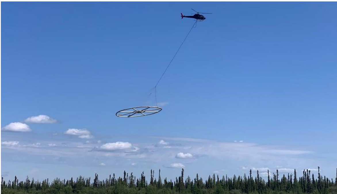
Figure 1: The Axiom Xcite TDEM airborne system in action.